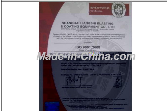
Description: ISO9001 Certificate