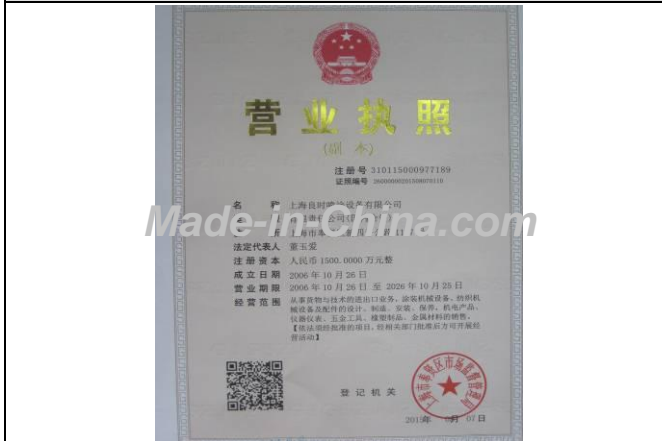
Description: Business License