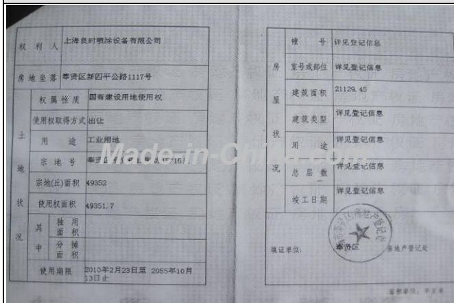
Description: Land Certificate