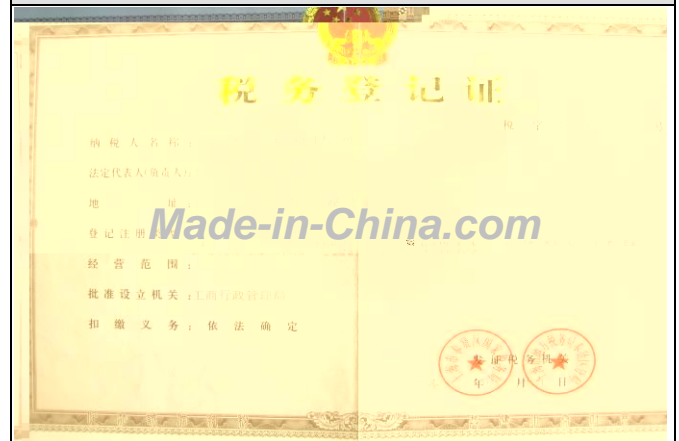
Description: Tax Registration