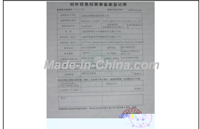
Description: Export License